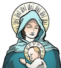
Solemnity of Mary

We are asking during the month of January that you write your name on your collection envelope to assist in posting. Thank you