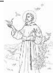
Saint Francis Feast Day Oct 4 th

Lord, make me a channel of your peace; Where there is hatred, let me sow love; Where there is injury, pardon; Where there is doubt, faith; Where there is despair, hope; Where there is darkness, light; And where there is sadness, joy; O divine Master, Grant that I may not so much seek to be consoled as to console; To be understood, as to understand; To be loved, as to love; For it is in giving that we receive, It is in pardoning that we are pardoned, And it is in dying that we are born to Eternal Life