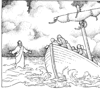
It is I; do not be afraid.