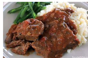
Swiss Steak Dinner

Come to the Church of the Transfiguration on TODAY Sunday, August 27 and enjoy a delicious Sunday Dinner. We open our doors at the parish hall at 10AM to 1:30PM. Come into our parking lot at 219 Third St Conemaugh. It is #13 a meal that includes hot Swiss Steak, in its own gravy, green beans, bun, salad and dessert. You will enjoy your dinner and relax and have fun.