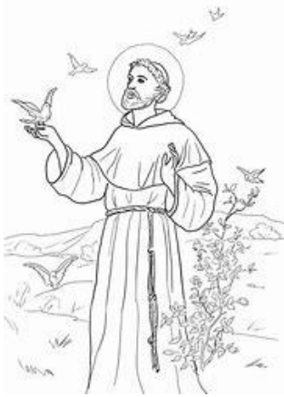
Saint Francis Feast Day Oct 4 th

Adapted from: BEREAVEMENT Publishing, Inc. 8133 Telegraph Drive Colorado Springs, CO 80920