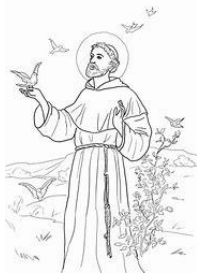
Saint Francis Feast Day Oct 4 th

Lord, make me a channel of your peace; Where there is hatred, let me sow love; Where there is injury, pardon; Where there is doubt, faith; Where there is despair, hope; Where there is darkness, light; And where there is sadness, joy; O divine Master, Grant that I may not so much seek to be consoled as to console; To be understood, as to understand; To be loved, as to love; For it is in giving that we receive, It is in pardoning that we are pardoned, And it is in dying that we are born to Eternal Life